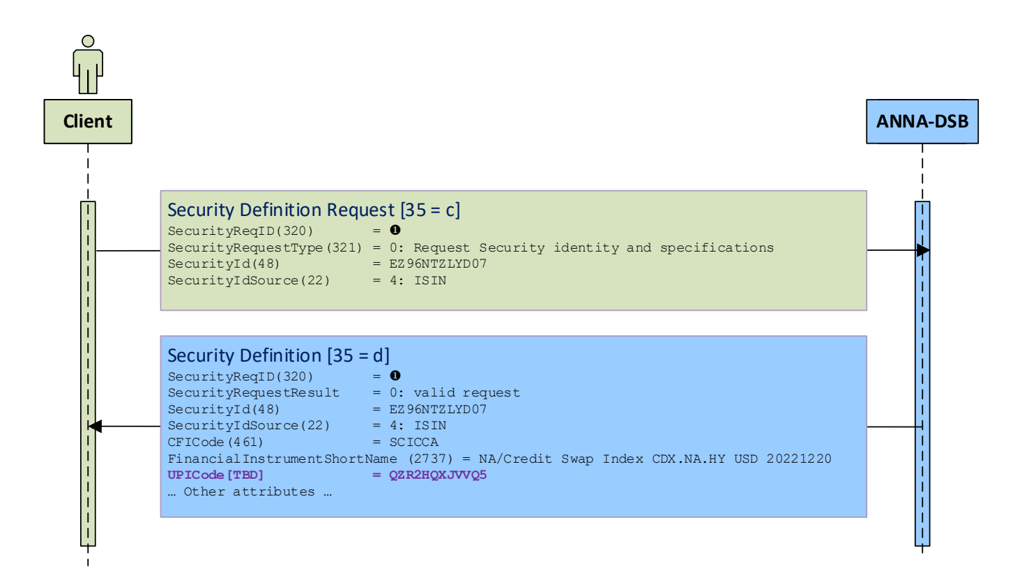
Figure 2: Proposed Message Workflow

The following diagram describes the proposed message flow: